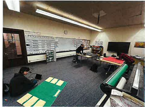
The 8th Grade students preparing their trifolds for their oral research presentation

Moreover, the 10th Grade just finished The Hunger Games and will continue with its sequel, Catching Fire .